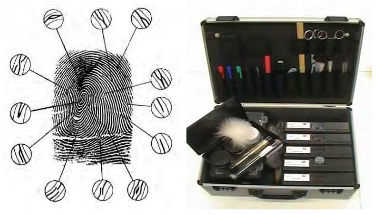
Figure 2. Fingerprint and fingerprinting suitcase.

Forensic science includes many areas of study, such as criminalistics, engineering science, and pathology and biology. The most reliable application of physics is when biomechanical analysis is used to explain injury mechanism, such as how an injury may have occurred. It is very important that the application of the free fall mechanics which originates as a result of mechanical interaction of the system "human and surrounding". Another topic, very interesting for students, is dactyloscopy. In this topic, various experiments can be done. Students can use the dactylographic suitcase and investigate the crime scene. Students learn the fingerprint patterns—arches, loops, whorls, and compounds. The students learn factors that affect the quality of latent prints (amount of fat and water, temperature, humidity, and exposure to sun) (See Figure 2).