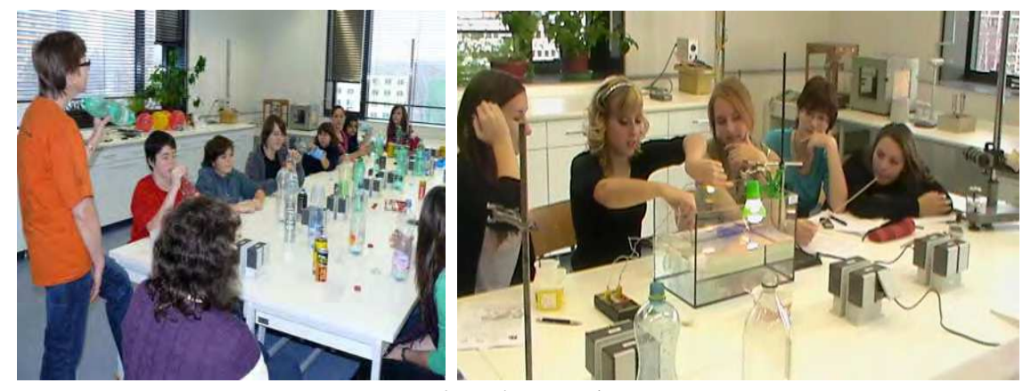
Figure 3. Hands-on experiments.

From all new modules, most interesting and amusing for students are hands-on experiments (see Figure 3). That module was realized at the author's department and repeatedly at schools—The author was invited not only to secondary schools but also to high schools. The most important characterization of that module, as mentioned in interview, was the own activity of students—All experiments they did by their own. The other two modules that students found as interesting and motivating were physics in the kitchen and physics and forensic science. The most important aspect was the relation to everyday life and curiosity. From the teachers' point of view, most interesting was the module nanotechnology. The module offers a lot of information that cannot be found in textbooks. The other interesting module was physics and forensic science. Only one high school used the module electronics.